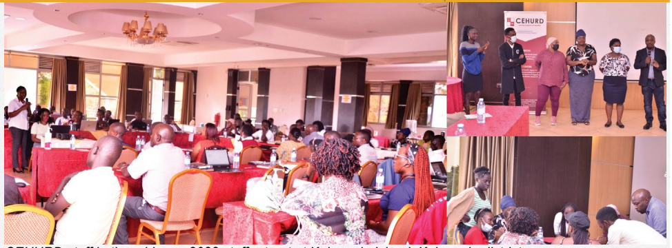
CEHURD staff in the mid year 2022 staff retreat at Kalangala Island, Kalangala district.

To strengthen organisational efficiency, we continued to invest in the development of our staff capacities in different areas. All staff had an opportunity to train in specific areas to enhance their knowledge and skills to better their performance. Four (4) of our staff and a volunteer completed their practice diploma at the Law Development Centre (LDC) – we wish to congratulate them. This enabled them to embark on the process of obtaining their practicing certificates. Our Finance staff were supported to participate in the annual seminar organised by the Institute of Certified Public