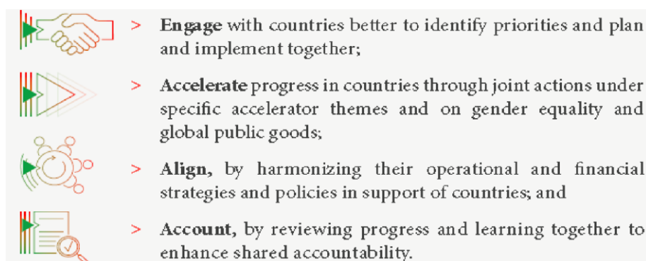
Figure 3: Illustration of four commitments of the GAP agencies to guide implementation of the Plan (from page 26 in the GAP document)

To reflect upon the three GHIs' approach to the four strategies of the GAP - i.e. engage-accelerate-align-account - we will briefly look into their joint action plan and their individual track record.